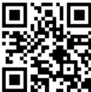
TI 83 and TI 84